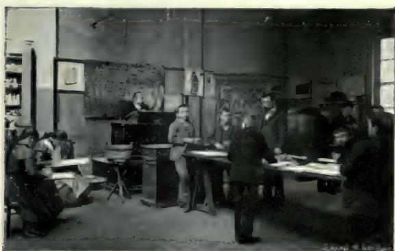
Fig. 27. DRAWING CLASS.

The school teaching is carefully adapted to the needs of the people of the Familistère. The children are taught, in lessons suited to their age, the economic